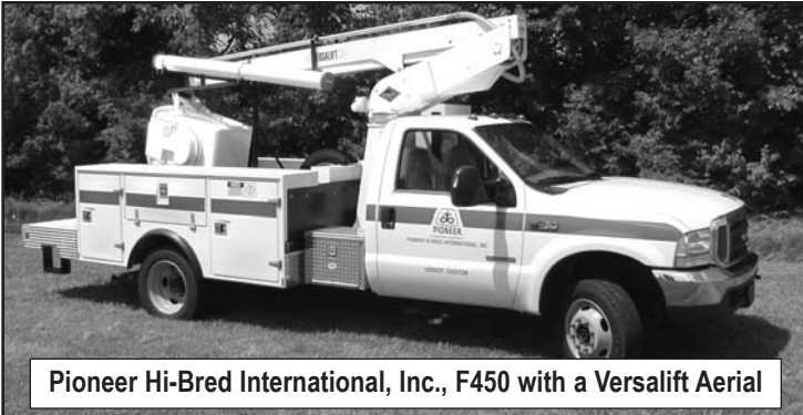
Pioneer Hi-Bred International, Inc., F450 with a Versalift Aerial